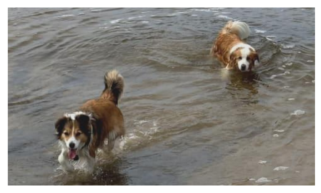
Willow and Scarlett have the best time at Randalls Bay!

Also in this issue: Garage Sale on 5 April, Greyhound Racing update and a warning about leaving dogs in hot cars.